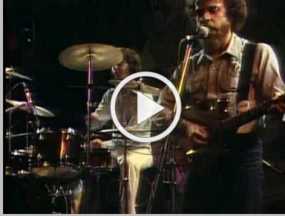
Circle - Harry Chapin, 1977