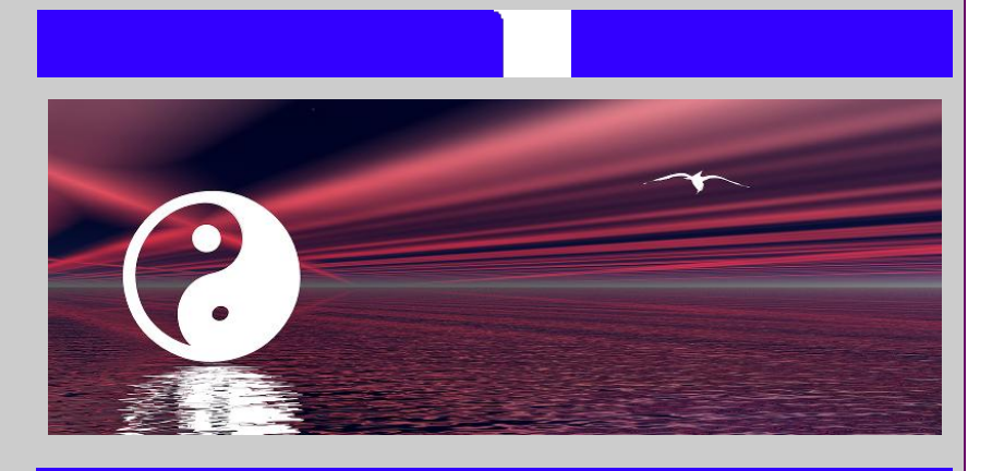
Caring Palms Promise

For practice, Brian is still offering to do some readings to anyone that wants to sit for one. Keep in mind, these are mediumship readings, not psychic readings. If you have an interest, please contact Brian and something can be scheduled.