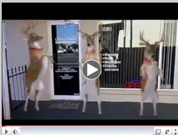
Caring Palms Holiday Greeting